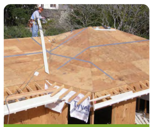
A durable roof with 24" overhangs to preserve the building envelope.