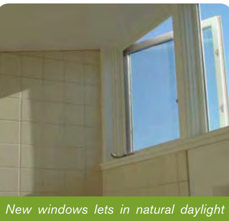
and helps reduce energy use.

The project received GreenPoint Rated points for being located in an urban setting served by public transit. The home also earned points for its efficient size and its location in a compact, walkable neighborhood.