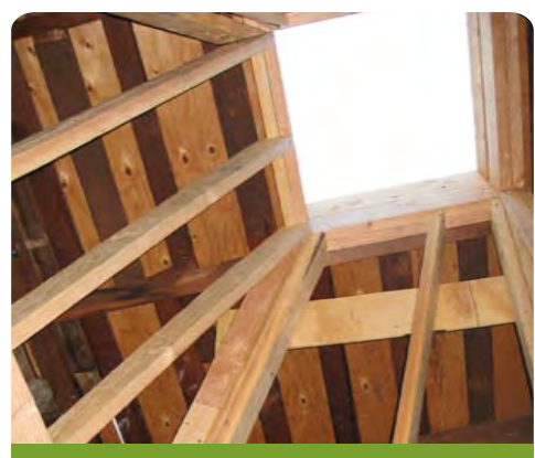
Skylight lets in natural daylight and helps reduce energy use.

The home has a detached garage, an excellent strategy for keeping car exhaust and other air pollutants out of the house. To further protect indoor air quality, low-VOC paints were used throughout the home's interior. The bathrooms and kitchen have exhaust fans that vent to the outside to remove moisture and odors. The HVAC system has a high efficiency filter to reduce indoor air pollution, and the home has an alarm to alert residents if carbon monoxide in the indoor air exceeds safe levels.