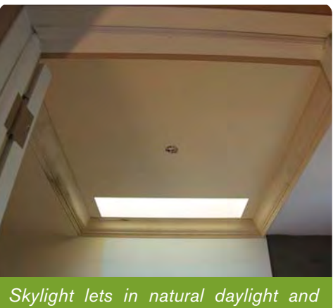
Skylight lets in natural daylight and helps reduce energy use.

The home's urban setting earned it GreenPoint Rated points. The neighborhood is well served by public transit, and shops, restaurants, neighborhood services and other amenities are in easy walking and bicycling range.