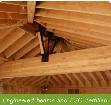
Engineered beams and FSC certified framing.

The project received GreenPoint Rated points for being located in a built urban setting with utilities already in place. Accessibility features include a zero step entrance, interior doors and passageways on the main floor that have at least 32-inch clear passage space, and blocking for grab bars in main floor bathrooms.